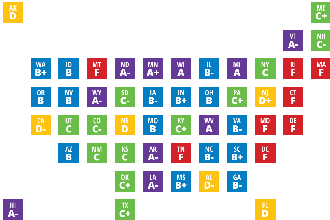
Figure 1: Distribution of State Grades